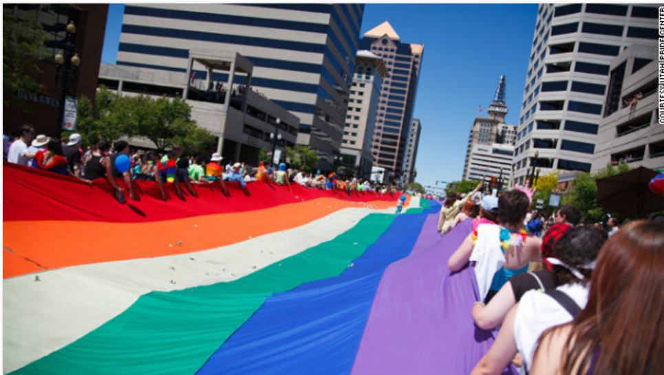
Salt Lake City's gay community is not as large as some other cities, but their pride parades are well-attended.