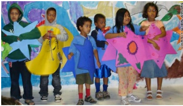
Be'chol Lashon's summer camp activities, like this play about the book of Genesis, are designed to help Jewish kids of all backgrounds strengthen their connections with the faith.